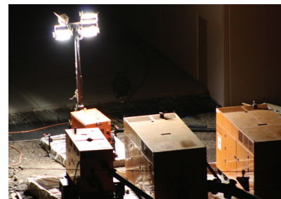
Diesel, Electric & Battery Powered Light Towers