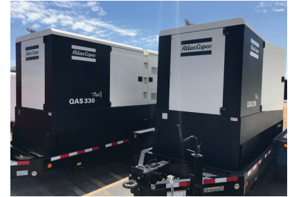
Portable & Standby Generators